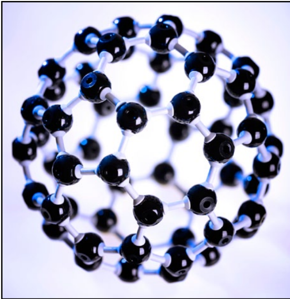
An example of a nanoparticle is a buckyball or fullerene.