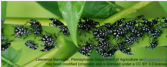
Spotted lanternfly nymphs, present in spring and summer months.