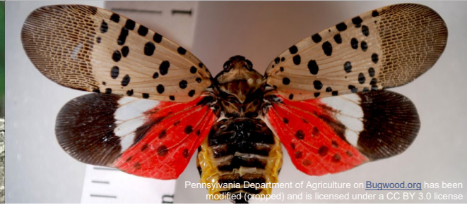
Adult spotted lanternfly, present in autumn months.