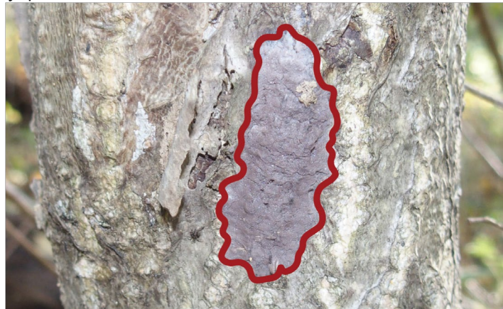
Spotted lanternfly egg mass (outlined in red). Egg masses are present in autumn and winter months, blending in with their surroundings.

By signing this checklist, I am confirming that I have inspected my vehicle and those items I am moving from the Spotted Lanternfly quarantine area, and do not see any egg masses or insects in or on anything I am moving.