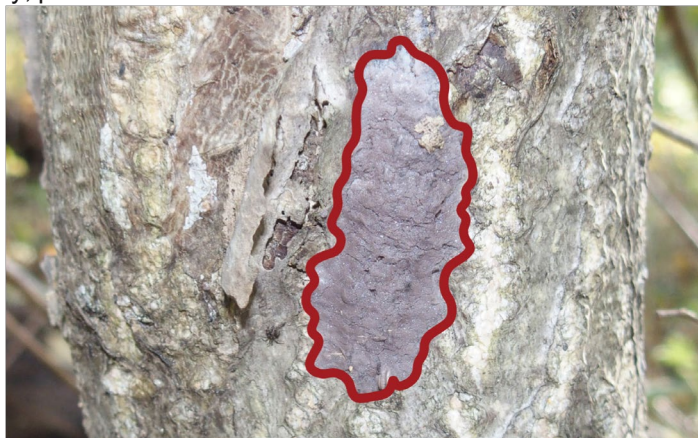
Spotted lanternfly egg mass (outlined in red). Egg masses are present in autumn and winter months, blending in with their surroundings.

By signing this checklist, I am confirming that I have inspected my vehicle and those items I am moving from the Spotted Lanternfly quarantine area, and do not see any egg masses or insects in or on anything I am moving.