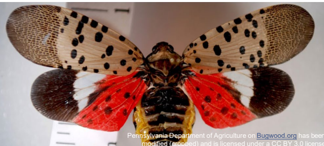
Adult spotted lanternfly, present in autumn months.