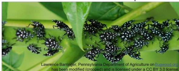
Spotted lanternfly nymphs, present in spring and summer months.